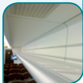
5 Luggage carrier